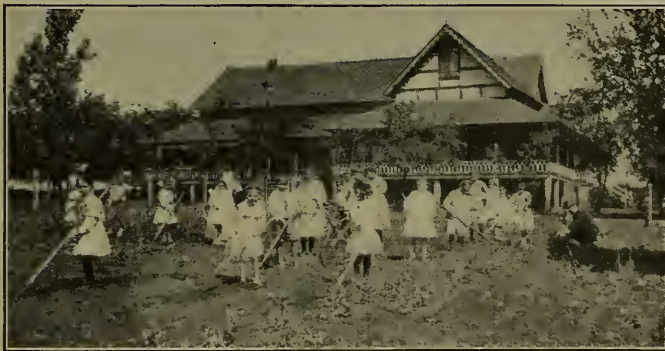
IN THE GARDEN OF THE WINTHROP SCHOOL.

The receipts in the school kitchen, and the directions for the work of the day, written on the blackboard, serve as reading